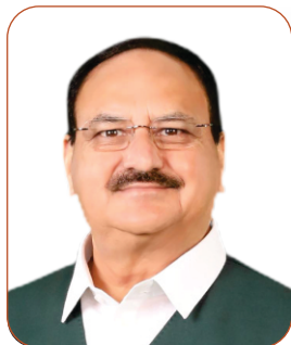
Shri Jagat Prakash Nadda Hon'ble Union Minister for Chemicals and Fertilizers & Health and Family Welfare

to drive innovation, strengthen partnerships and unlock India's vast, untapped potential in chemicals and petrochemicals.